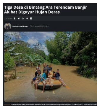
Figure 2. Disaster occurrence news documentation on teras7.com