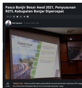
Figure 3. Post-disaster news documentation on teras7.com

Entman sees framing in two major dimensions; issue selection and emphasis or prominence of certain aspects in reality. Reality that is presented prominently or strikingly has the potential to have a greater impact on attracting attention and influencing the audience in understanding and accepting a reality (Sulaeman 2024). Through Entman's analysis of the news about the flood disaster in South Kalimantan, it can be seen that the prominent impression from the news is the role of the regional executive in dealing with floods rather than the flood disaster itself. This can be seen from the choice of words and titles that are placed, giving the impression that local officials are making an extraordinary effort but seem excessive in their choice of words, such as " gulung celana " which is included in the title.