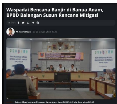
Figure 1. Pre-disaster news documentation on teras7.com