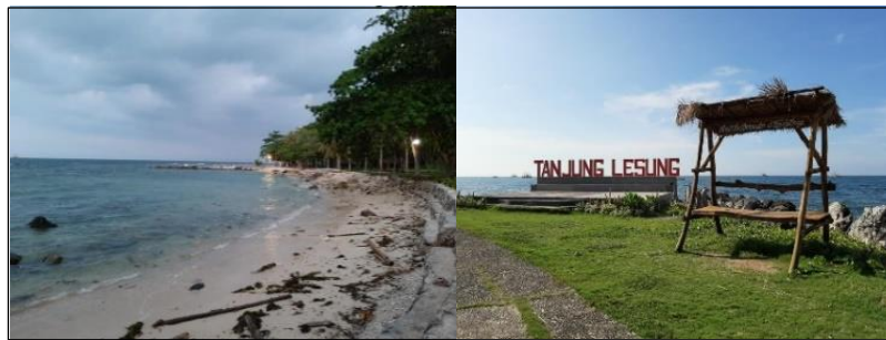
Figure 1. Tanjung Lesung Tourism Destination After Tsunami Disaster

However, the government's unpreparedness prevented the plan from being realized, and the company still bore the management.