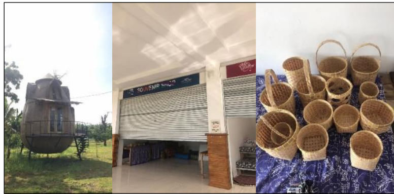
Figure 2. Condition of Bufferzone Villages After Tsunami Disaster

arts, making palm sugar, and many other exciting choices. CEC is managed by youth from a tourism awareness group in Tanjungjaya Village. Many community groups are empowered to develop tourism in the villages around the Tanjung Lesung SEZ, from crafts, culinary, arts, to tourist village homestays (Cikadu, 2019). After the tsunami disaster, tourism development in the buffer zone stopped and almost died. Cultural tourism is difficult to develop because of the decreasing number of tourists who come.